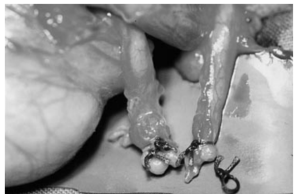
Figure 2. Findings during reversal of vasectomy performed 29 h before via ligation of the U-shaped vas ends. Ligation decreases the blood circulation in the vas ends and the tissue becomes necrotic. One of the threads is already free and two open lumina of the vas are visible.

The best-known minimal invasive technique is the 'no-scalpel vasectomy' from China (Li et al. , 1991). By means of a special clamp, the skin covering the vas deferens is perforated and separated, followed by opening of the sheath layer. Thereafter, the vas is grasped with special forceps. The subsequent procedure is similar to that of the fulguration technique described above. This method is currently the least traumatic procedure, and is increasingly being used worldwide (Holt & Higgins, 1996; Skriver et al. , 1997; Kumar et al. , 1999; Sokal et al. , 1999), because the complication rate of 0.4% is much lower than that after conventional vasectomy (3.4%), although in the 'good hands' of an experienced surgeon the incidence of complications for no-scalpel vasectomy is virtually the same as that for the standard incision method (0.3%)