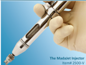
The MadaJet Injector Item# 2500-V